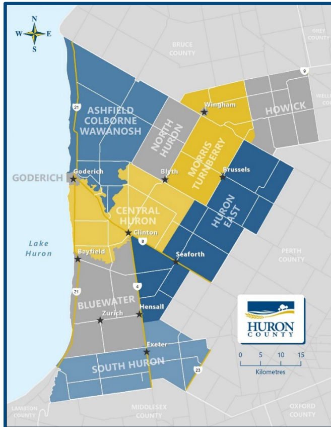
Huron County Map

The Huron County Accessibility Advisory Committee (HCAAC) serves as the Accessibility Advisory Committee (AAC) for Huron County, mandated by the Accessibility for Ontarians with Disabilities Act (AODA), 2005, S.O. 2005, c. 11 . HCAAC is dedicated to advising Huron County Council on the implementation of accessibility standards across the County's nine partner municipalities (see Appendix for HCAAC's objectives and priorities). Comprising primarily of individuals with disabilities, the committee plays a vital role in creating an accessible community by providing input on accessibility plans, site developments, and public spaces. Through education, consultation, and advocacy, the HCAAC ensures that Huron County remains inclusive and accessible for everyone.