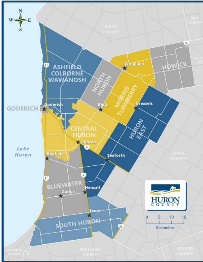
Huron County Map

The Huron County Accessibility Advisory Committee (HCAAC) serves as the Accessibility Advisory Committee (AAC) for Huron County, mandated by the Accessibility for Ontarians with Disabilities Act (AODA), 2005, S.O. 2005, c. 11 . HCAAC is dedicated to advising Huron County Council on the implementation of accessibility standards across the County's nine partner municipalities (see Appendix for HCAAC's objectives and priorities). Comprising primarily of individuals with disabilities, the committee plays a vital role in creating an accessible community by providing input on accessibility plans, site developments, and public spaces. Through education, consultation, and advocacy, the HCAAC ensures that Huron County remains inclusive and accessible for everyone.